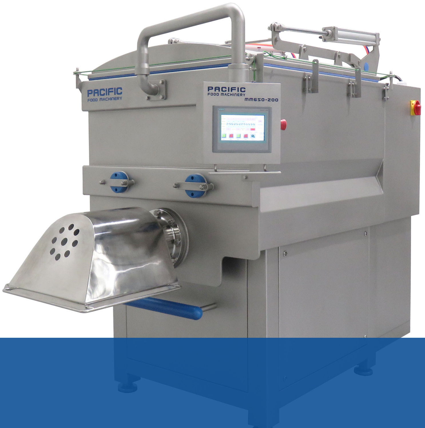
PACIFIC 650L/200MM MIXER MINCER